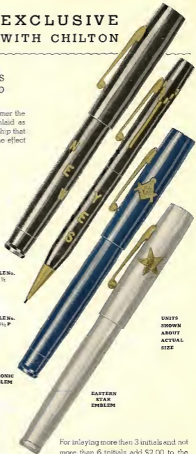
UNITS SHOWN ABOUT ACTUAL SIZE

For inlaying more than 3 initials and not more than 6 initials, add $2.00 to the price of each writing instrument so initialed.